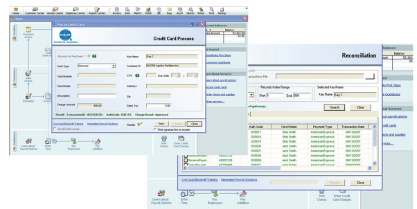
Screenshots from QuickBooks with Solution