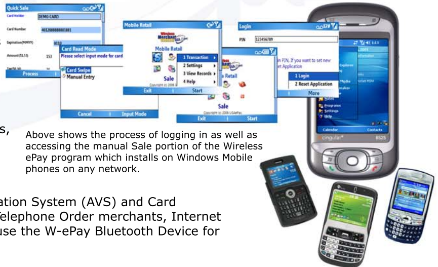
Above shows the process of logging in as well as accessing the manual Sale portion of the Wireless ePay program which installs on Windows Mobile phones on any network.

The software also supports the Address Verification System (AVS) and Card Verification Value (CVV) for your Mail Order / Telephone Order merchants, Internet merchants, or for those merchants who don't use the W-ePay Bluetooth Device for swiping the card during the transactions.